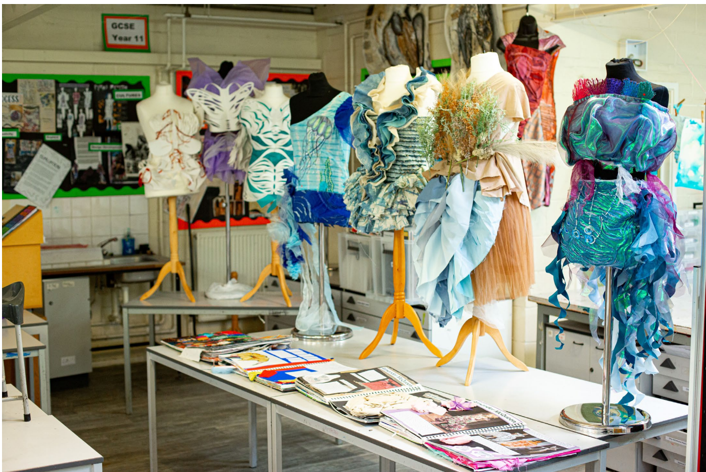
Here is some wonderful work from Textiles. The A-level work shown (first image) reflects two students' personal investigations. The first topic explored is entitled the 'Notification of magnification'. The second topic explored is entitled 'Nature and architecture'. The work demonstrates research, sampling, designs, and final outcomes. GCSE work shown (second image) reflects outcomes based on the theme of 'the sea'.